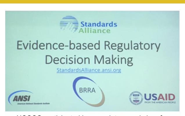
NCCCO participated in a regulatory workshop for Zambian government officials organized by ANSI, USAID and the Standards Alliance.

NCCCO representatives continue to actively participate in the international certification and accreditation community with recent staff representation at the annual meeting of the International Accreditation Forum (IAF) in Singapore; a special presentation to the Singapore Ministry of Manpower; the annual conference of the Crane Industry Council of Australia (CICA); a workshop for Zambian government officials on regulatory decision making in Lusaka; and a keynote presentation at the 2018 International Vocational Education and Training Association (IVETA) conference hosted by the South African College Principals Organization in Cape Town, South Africa. Read More